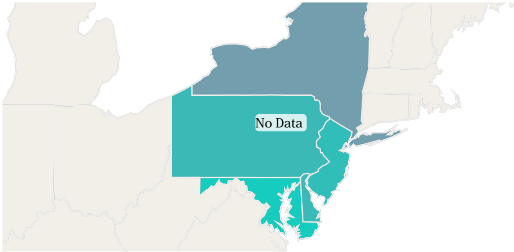
Days Late by State