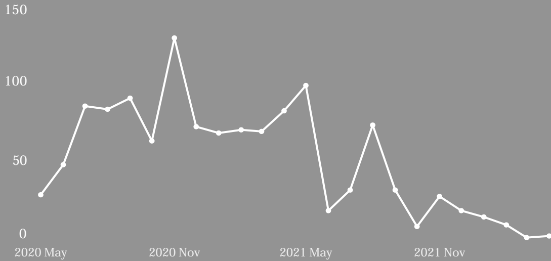
Days Late by Invoice Type